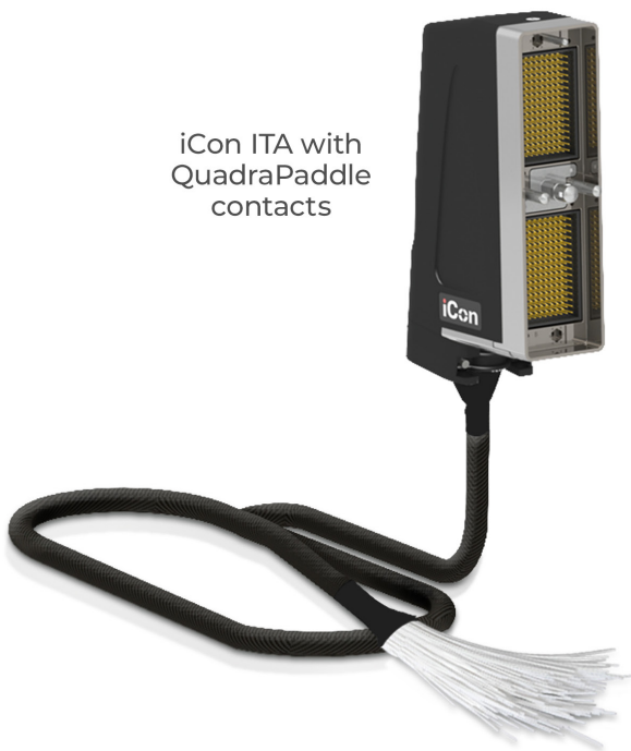
iCon ITA with QuadraPaddle contacts