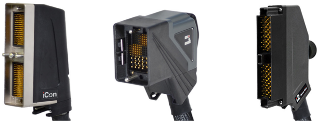
ITA connector options