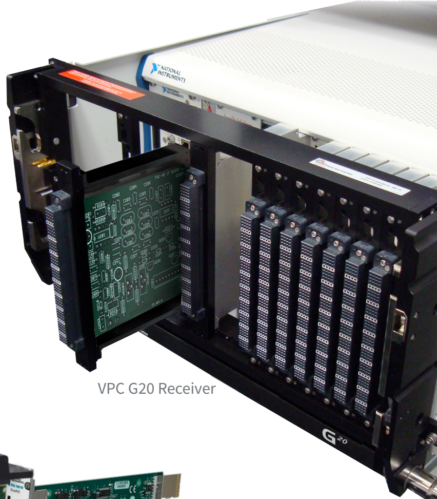
VPC G20 Receiver

VPC's Pull-Thru interfaces deliver reliable performance in an innovative platform. Designed on 0.80" (20.32 mm) centers to correspond with PXI system slot requirements; the G20, G20x, and G40x systems provide the convenience of a direct connection to instrument modules, enabling pull through removal of connector modules and instrumentation from the chassis backplane.